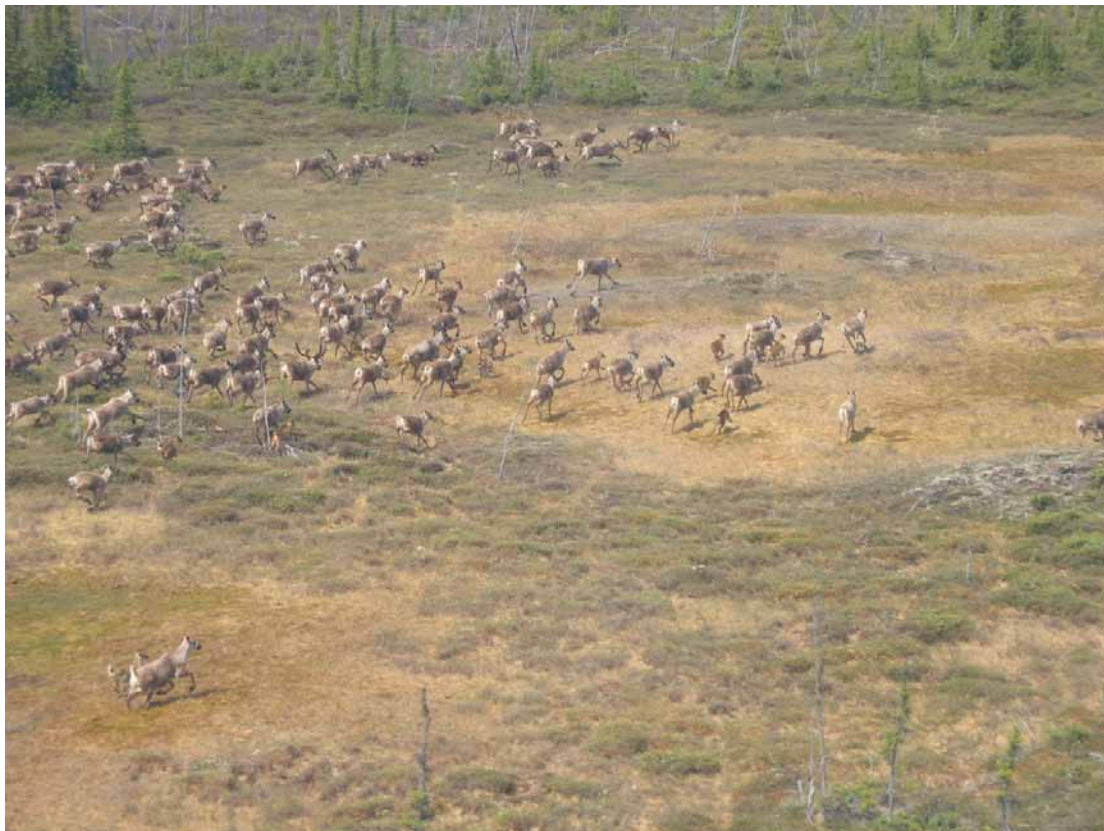
Photo 7-2 shows the largest grouping of coastal caribou observed inland, and in proximity to the Keeyask area. Possible causes of the shift in distribution from the Hudson Bay coast in Manitoba east to Cape Henrietta Maria in Ontario include habitat change, disturbance, nutritional stress due to range deterioration, and increased mortality due to differences in hunting and predation pressure across the range (Abrahams et al. 2012). Summer use of the Keeyask region is described below, including cases where Pen Islands caribou appeared to be calving in the Stephens Lake area.

Aerial surveys of known calving grounds along Manitoba's Hudson Bay coastline indicate that summer residency has declined in the province, and some animals may have moved inland (Abraham et al. 2012).