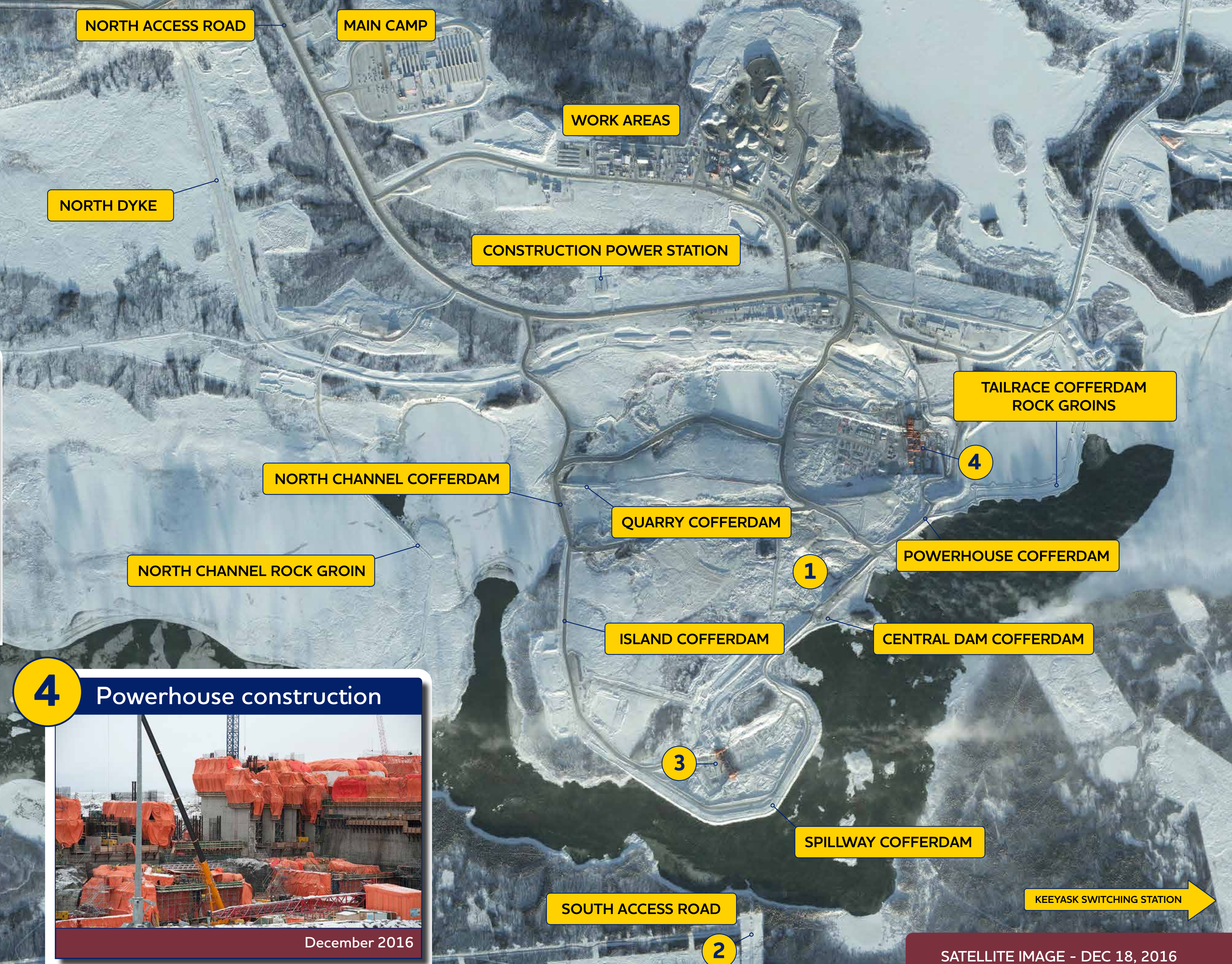
SATELLITE IMAGE - DEC 18, 2016