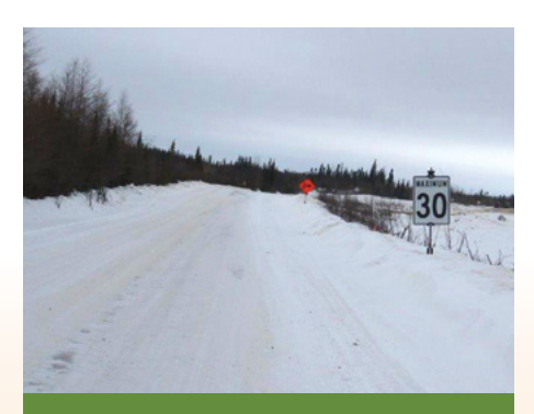
Slowing down in road construction zones and atching for construction vehicles is crucial

Construction of the South Access Road is also underway. The 35 kilometre (km) South Access Road (SAR) will connect the Town of Gillam to the Keeyask Generating Station site.