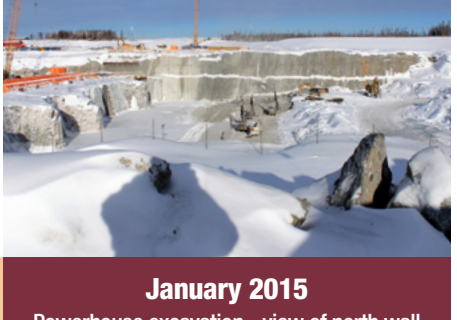
Powerhouse excavation - view of north wall