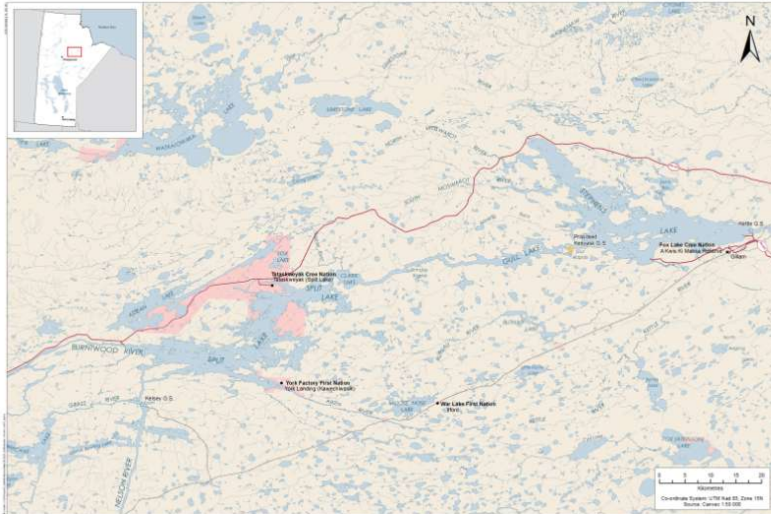
Figure 1. Map of Kelsey to Kettle GS reach.