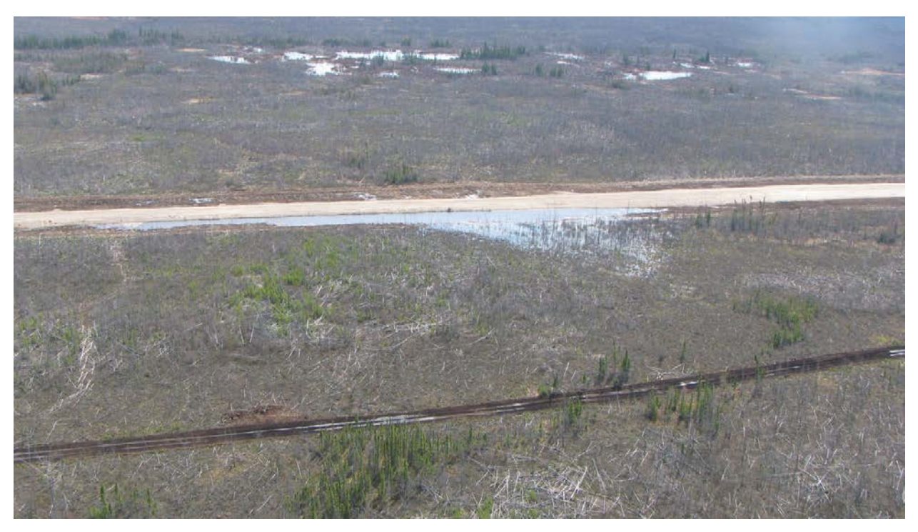
Photo 3-2: Ponding of Water Along the KIP Road ROW During Construction (May 2012).

Some of the wetlands sampled in 2011 fell within the Project footprint, and as expected, were lost with the development of infrastructure (e.g., road). The loss of these wetlands are anticipated to be off-set by the creation of new breeding habitat in decommissioned borrow pits. In 2012, evidence of ponding along the KIP road ROW was observed at some locations (Photos 3-2 and 3-3). These areas were not found to be suitable for frog breeding in 2012.