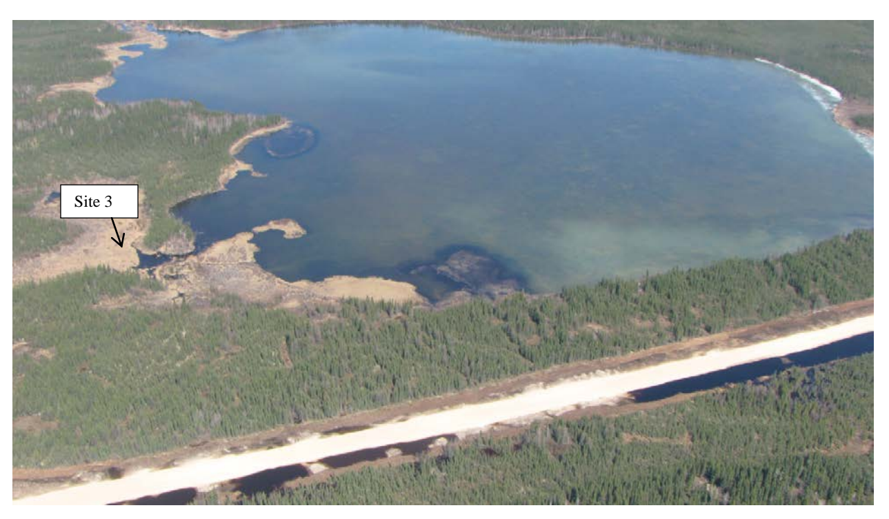
Photo 3-3: Ponding of Water Along the KIP Road near Site 3 (May 2012).