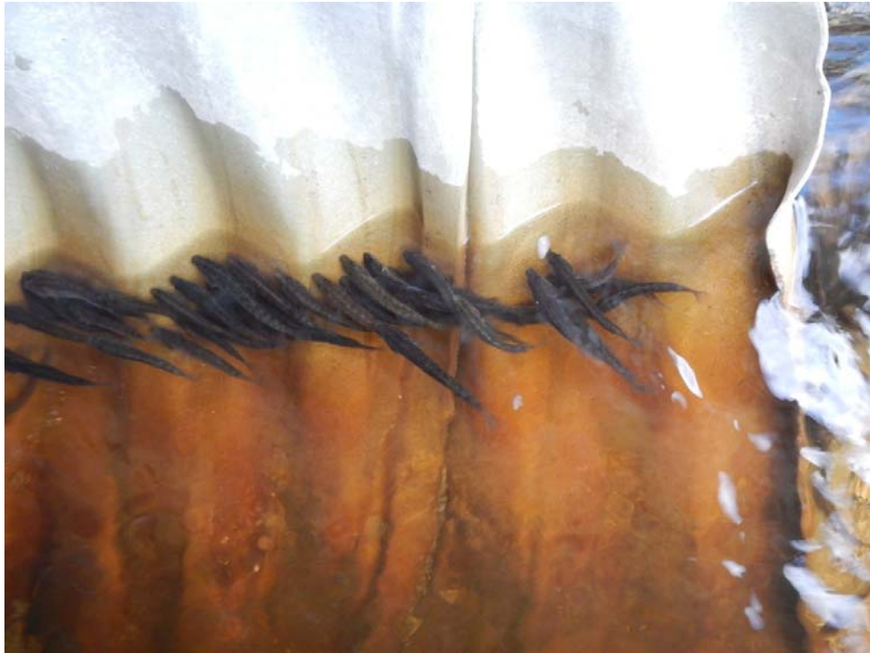
Figure 4. Brook Stickleback in the culvert at the unnamed tributary on August 20, 2013.