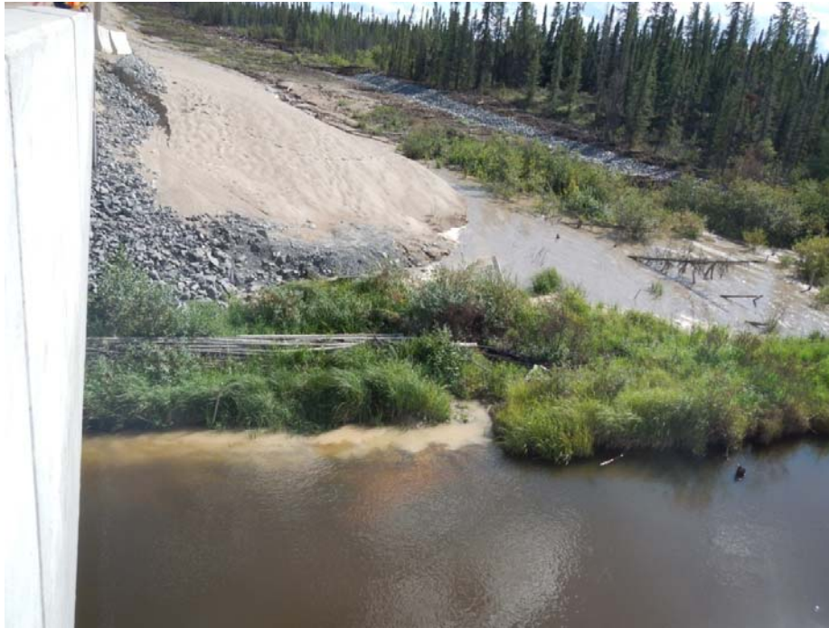
Figure 6. Sediment plume entering Looking Back Creek from the left-hand bank, August 20, 2013.