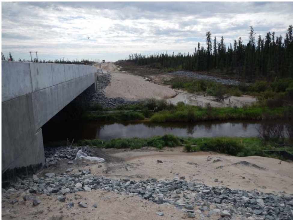
Figure 5. Exposed shorelines at Looking Back Creek on August 20, 2013.