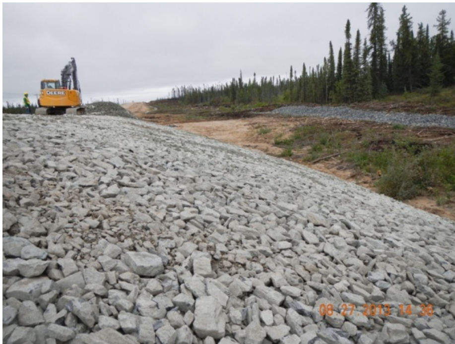
Figure 7. Rip rap installation on each shore surrounding the clear-span bridge at Looking Back Creek, August 27, 2013.