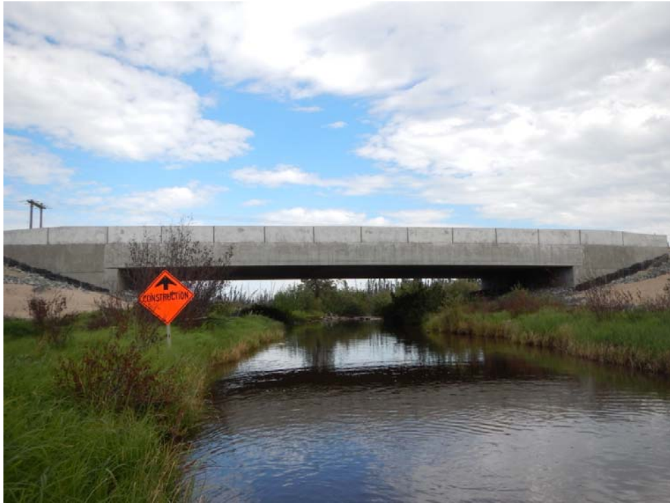
Figure 2. Clear-span bridge over Looking Back Creek.