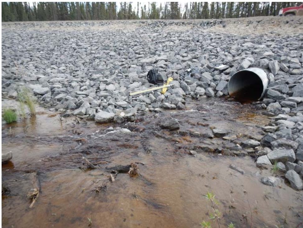
Figure 3. Road crossing for the unnamed tributary.