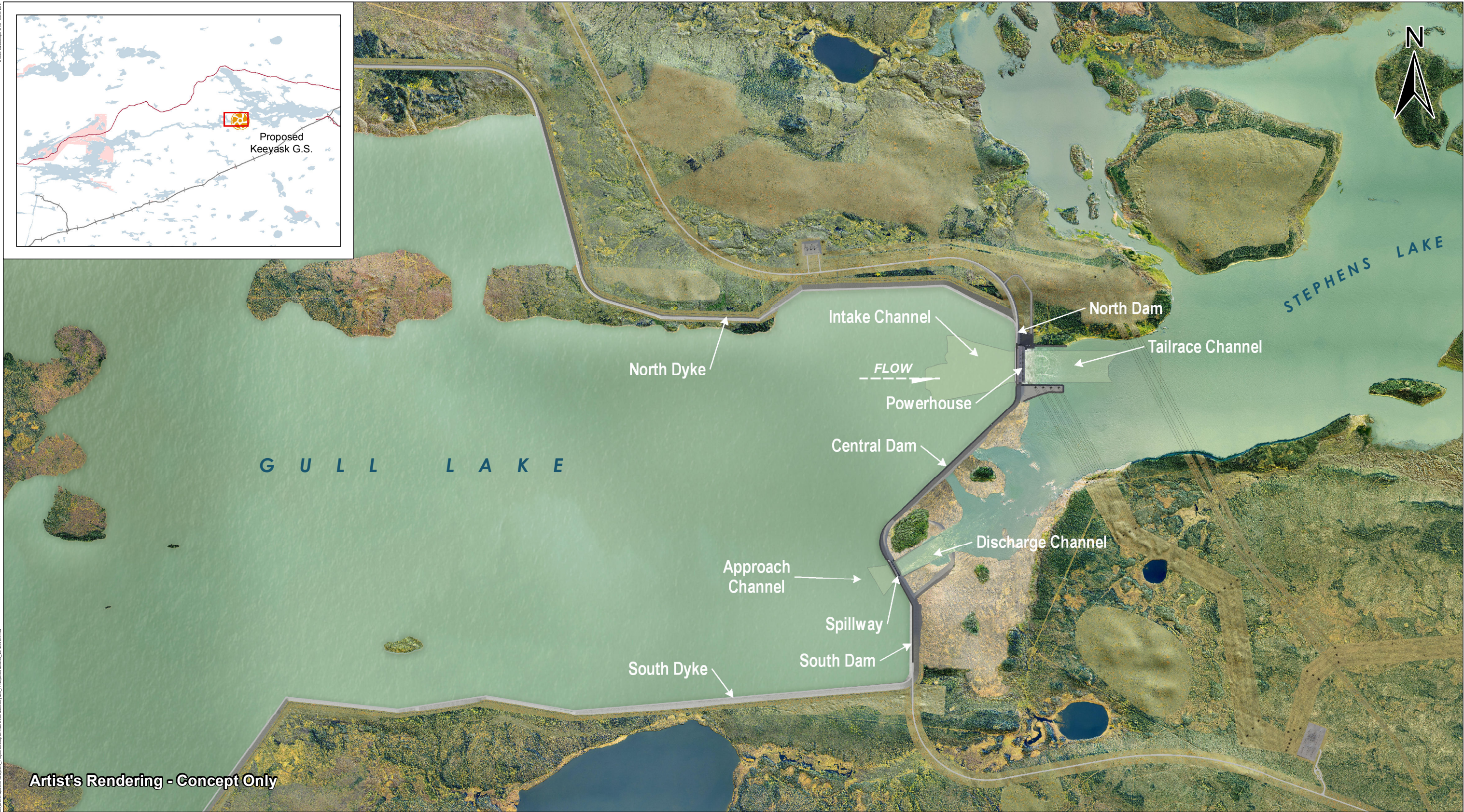
Artist's Rendering - Concept Only