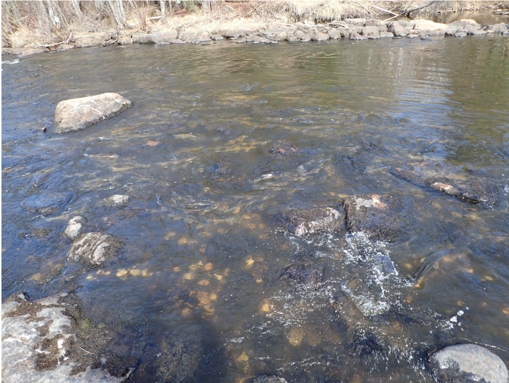
4 - Landing River