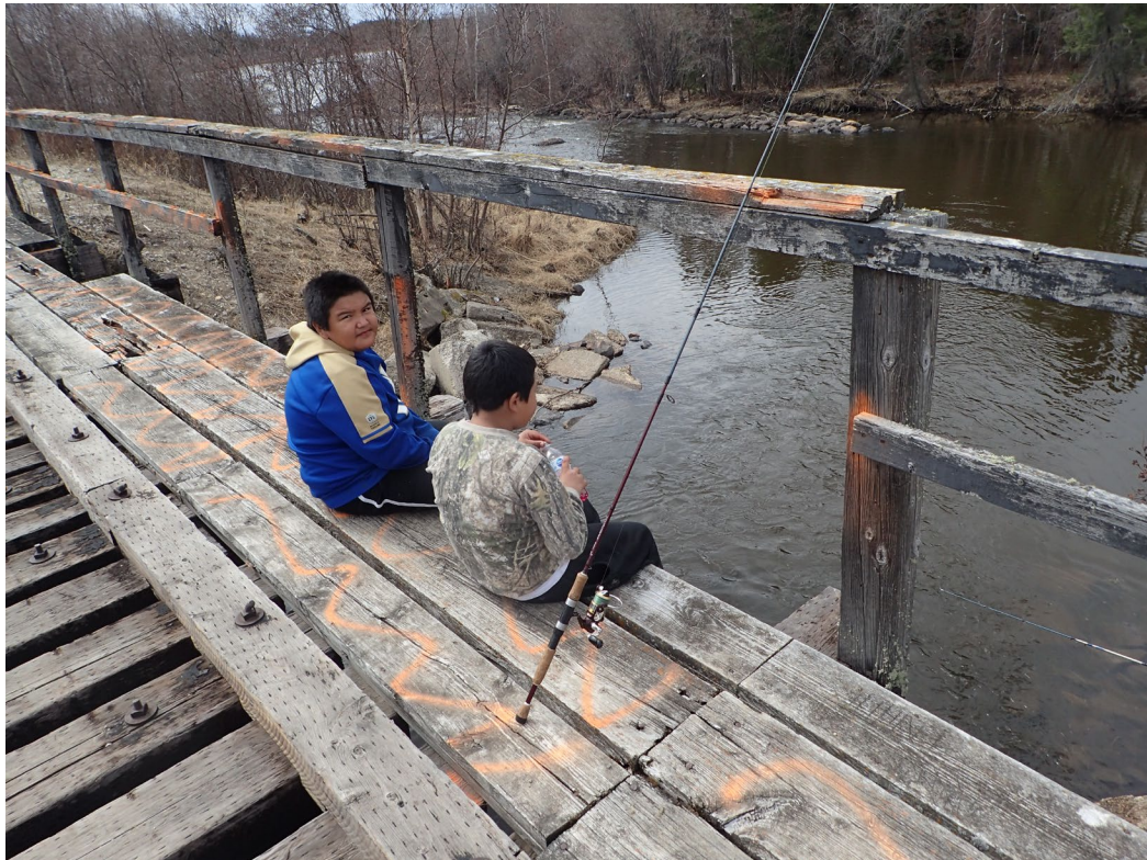
5 - War Lake Youth Fishing from the Bridge