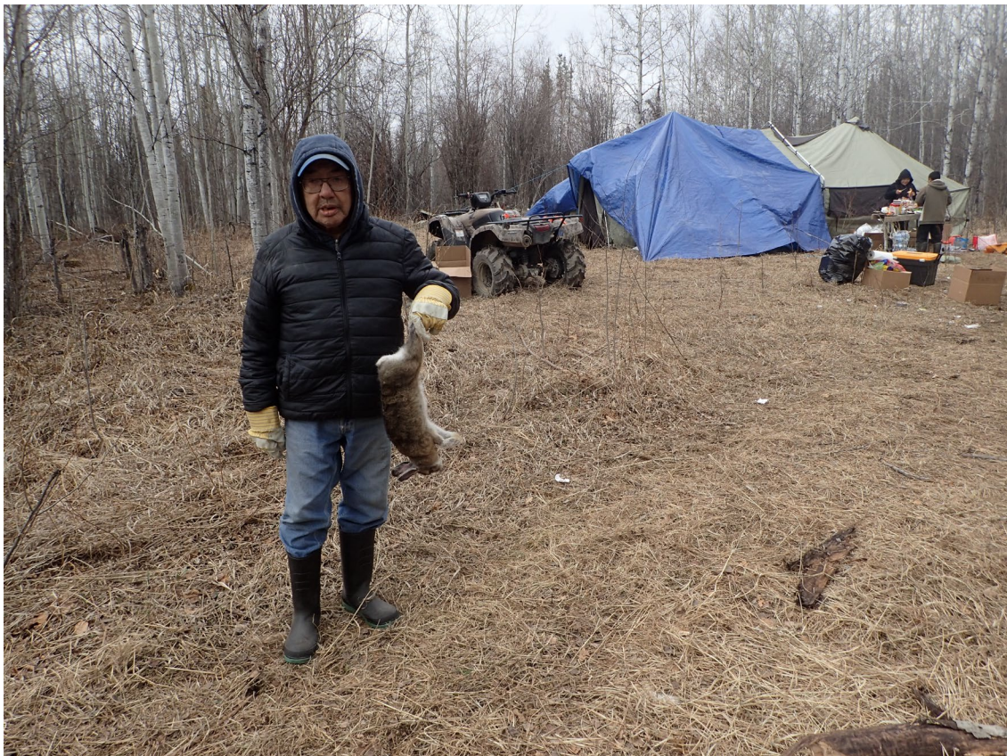
War Lake Member Snaring a Rabbit