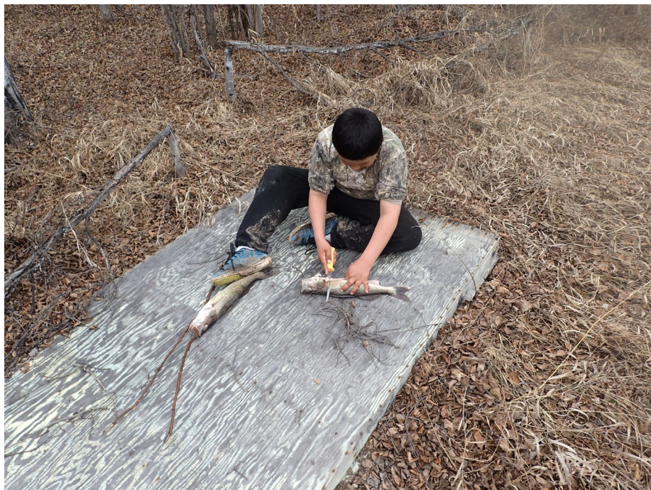
War Lake Youth Preparing Pickerel at Landing River