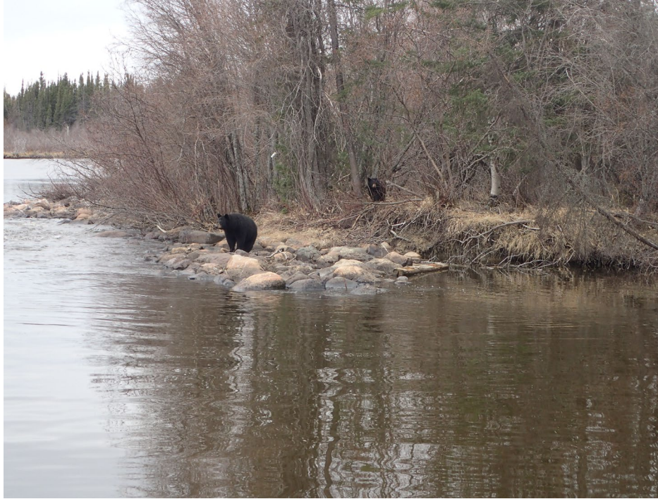
7 – Black Bears