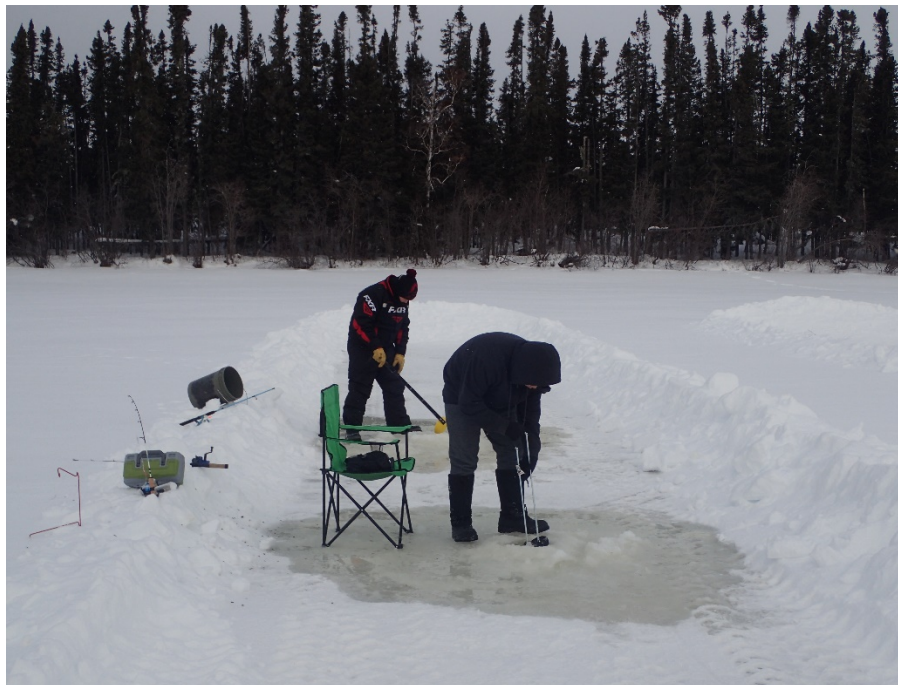
War Lake Youth Fishing at Atkinson Lake

Many people miss having easy access to pickerel at the Landing River site and on Moosenose Lake. It was reported that fishing for jackfish and whitefish continues at Moosenose Lake in the winter and summer months. Fish stocks are healthy, possibly more plentiful and much improved in quality since the fish plant at Ilford closed in the late 1970s. At that time, there were many floatplanes flying in with commercial catches, polluting the water with fuel. These observations about the improved quantity and quality of fish in general throughout War Lake's Traditional Use Area due to a decrease of commercial fishing activity were also noted by War Lake resource users interviewed in during the 2009-2010 community fieldwork studies.