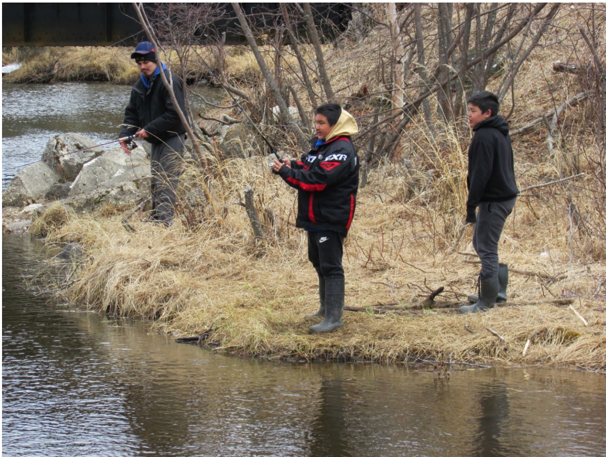
War Lake Youth Fishing at Landing River

The group of ATK Monitoring Trip participants, which included six youth, witnessed the slaughter of possibly as many as 10 caribou with remains strewn at the side of the road. War Lake Members and leadership are reporting these instances of slaughter, indicating disrespectful and wasteful hunting practices, on a regular basis. Although the winter road provides the infrastructure required for War Lake Members to travel to highly valued areas, it also provides similar access to outside hunters. War Lake continues to explore potential ways to address the problem, including posting signs to remind outsiders to hunt respectfully.