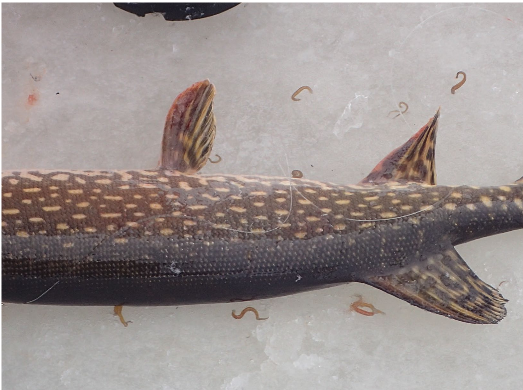
Suspected Leech " Piscicola. " on Jackfish from Atkinson Lake

Over the first two days of their stay on Atkinson Lake, participants mostly caught jackfish and some pickerel by the end of their trip. Of note were the leeches observed on many of the jackfish pulled from the lake. Advisors undertook some preliminary research into what type of leech was occurring and through visual assessment of photographs taken, believe them to be a type of leech. The photographs were also shared with a fish biologist and a parasitologist from North South Consultants who based on the body type and large size of the oral sucker, believed the leeches to be " piscicola sp. ", which generally attach themselves to the outside of the fish. It was agreed that a fish sampling kit should be used on future ATK Monitoring trip in order to collect and analyze samples.