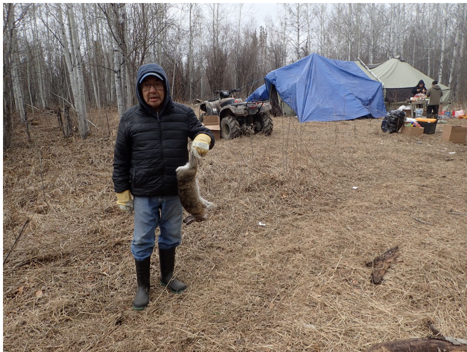
8 – A Snared Rabbit