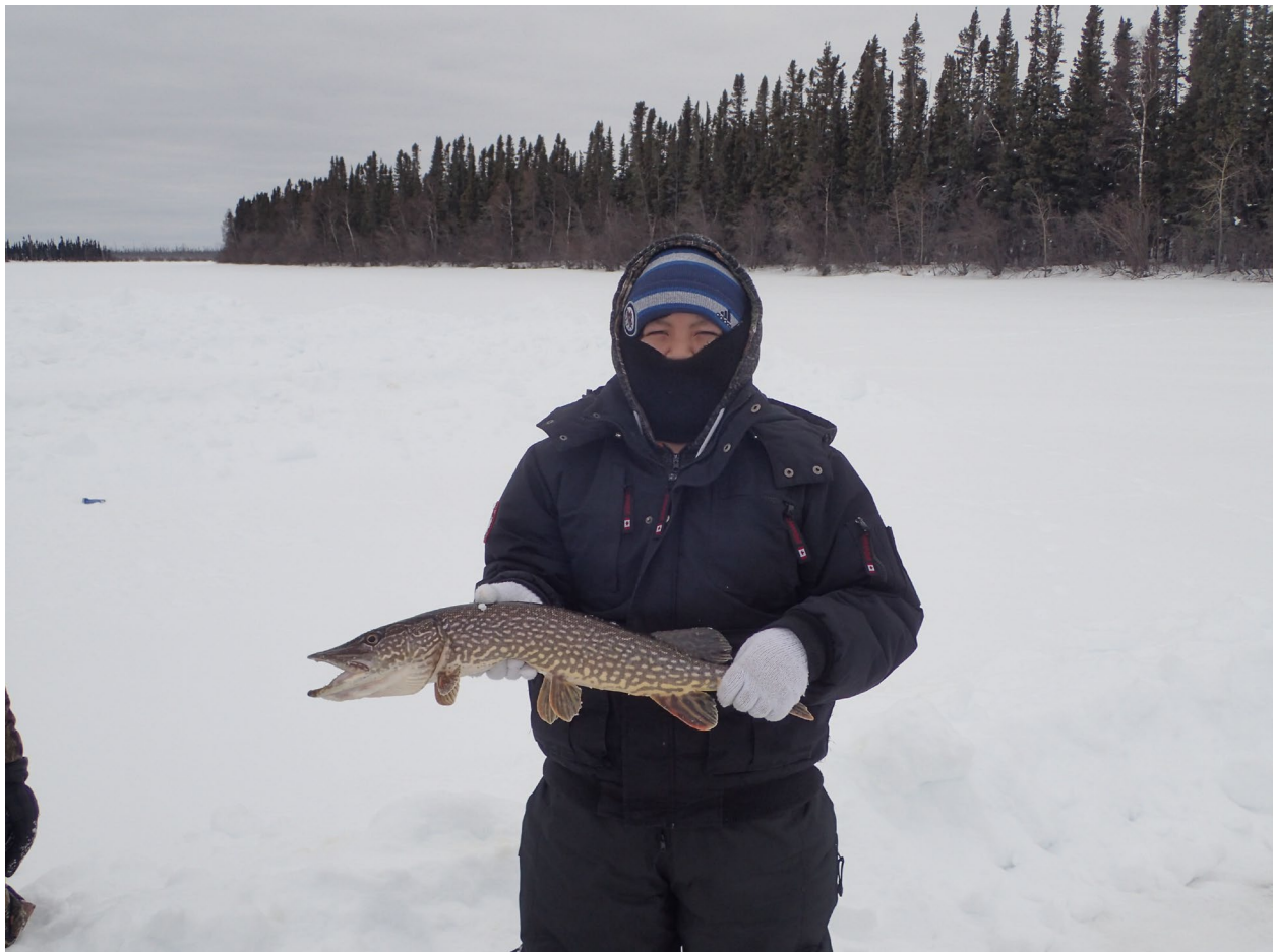
War Lake Youth Caught a Jackfish at Atkinson Lake

The fish focused Resource Users Roundtable session included discussion about healthy diets. Resource users reported that traditionally, fall proteins included fish, chicken (grouse), rabbit, beaver, muskrat and moose. Winter proteins were predominantly caribou and fish while spring proteins consisted of geese, duck and fish. Some participants recalled their parents and grandparents eating the back quarters of lynx, which were referred to as “big rabbit legs”. In the past, when food was scarce and modern refrigeration non-existent, it was not uncommon to eat the same protein 3 times a day and for several days in a row. The introduction of household freezers allowed for more variety including freezing berries and fish to consume year round.