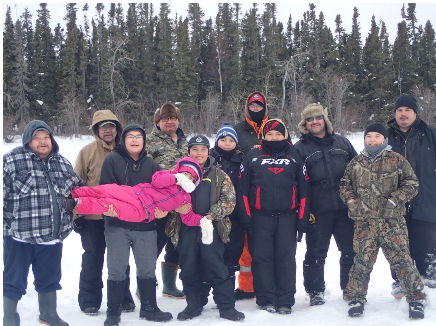
War Lake ATK Monitoring Group at Atkinson Lake

These observations were consistent with the findings of the 2009 Moose Hunter Survey. Hunters interviewed predominantly indicated that they were taught by their fathers to hunt. They also confirmed the large role family plays in participating in traditional pursuits together. These observations were also supported by interview responses from participants interviewed during the 2009-2010 community fieldwork studies that identified the benefits of hunting as follows: healthy food; traditional activity; ancestral identity; and family and community recreation.