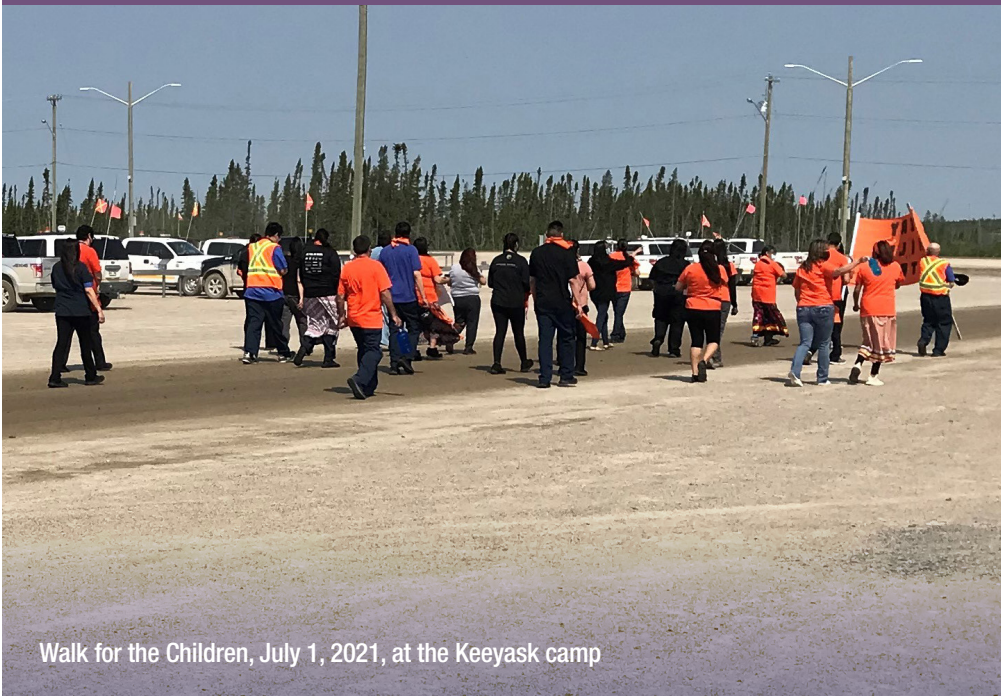
Walk for the Children, July 1, 2021, at the Keeyask camp

At the completion of the walk, a sharing and healing circle was held in ERS, as well as a meal.